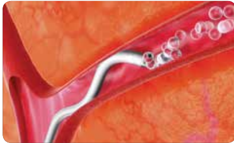
The Merit Maestro Swan Neck configuration is designed to access and maintain position in arteries with acute angles such as the hepatic artery.

The Merit Maestro is a multipurpose microcatheter designed for use in peripheral and coronary vasculature. It features a hydrophilic coating for smooth traction through tortuous anatomy, a radiopaque marker for easy identification of the distal tip, and an exclusive swan neck design to help seat the catheter in the vessel reducing the recoiling effect as the embolic agent is introduced.